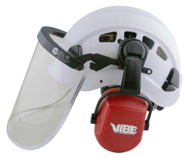
16797 Face shield and ear muffs sold separately