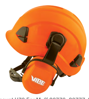
Capmount H70 Ear Muff 20776, 20777, 20778 (Hard hat and ear muffs sold separately)